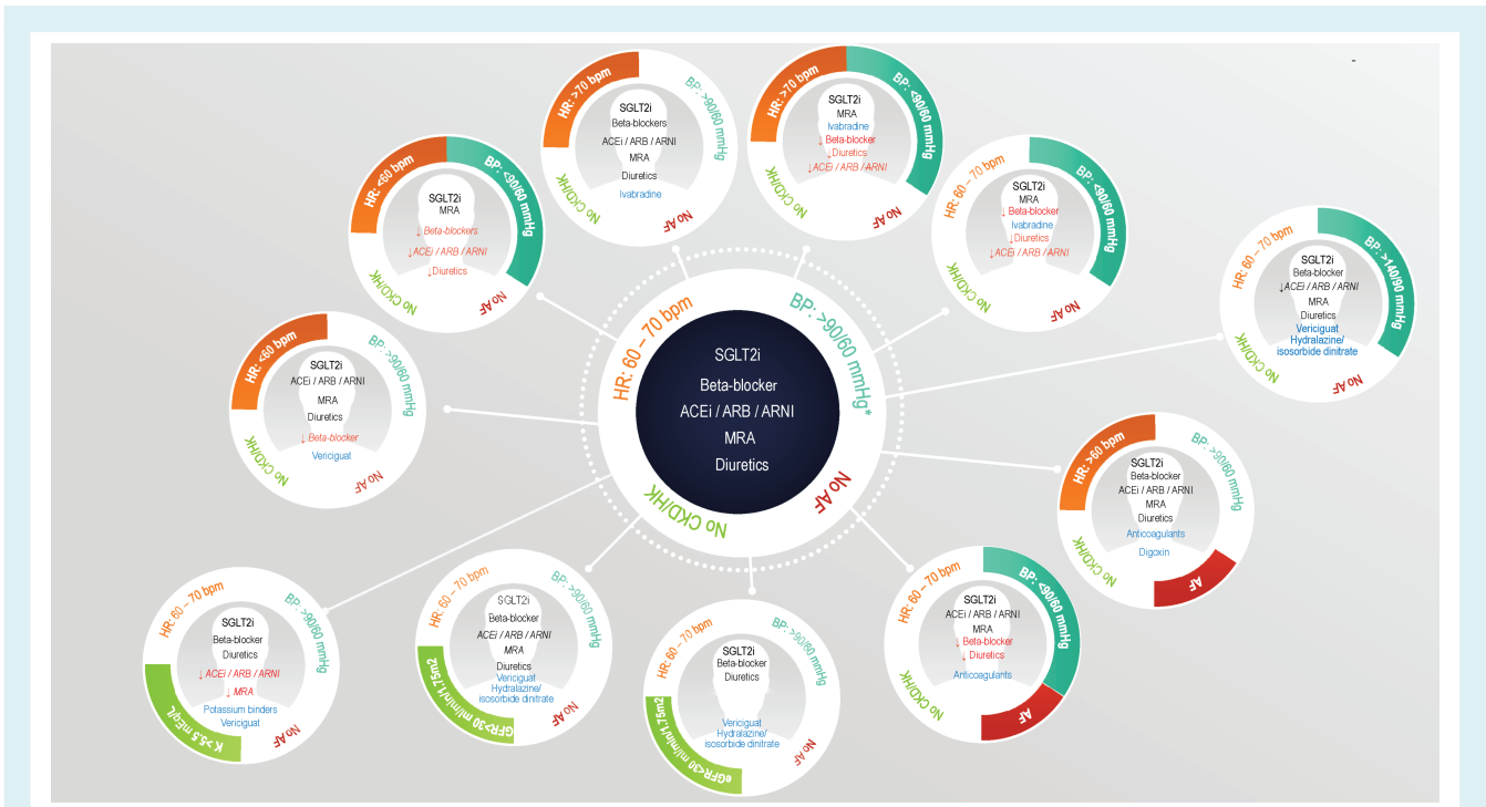
Figure 2 Tailoring of medical therapy according to clinical profiles. According to some patient characteristics – blood pressure (BP), heart rate (HR), presence of atrial fibrillation (AF), chronic kidney disease (CKD) or hypertension, some drugs may have to be reduced, discontinued, or added. Black—drugs that should be given to patients; red—drugs that should be reduced or discontinued; blue—drugs that should be added. *In patients with predominant chronic coronary syndrome, BP threshold is 120/80 mmHg. ACEi, angiotensin-converting enzyme inhibitor; ARB, angiotensin receptor blocker; ARNI, angiotensin receptor–neprilysin inhibitor; MRA, mineralocorticoid receptor antagonist; SGLT2i, sodium–glucose co-transporter 2 inhibitor.