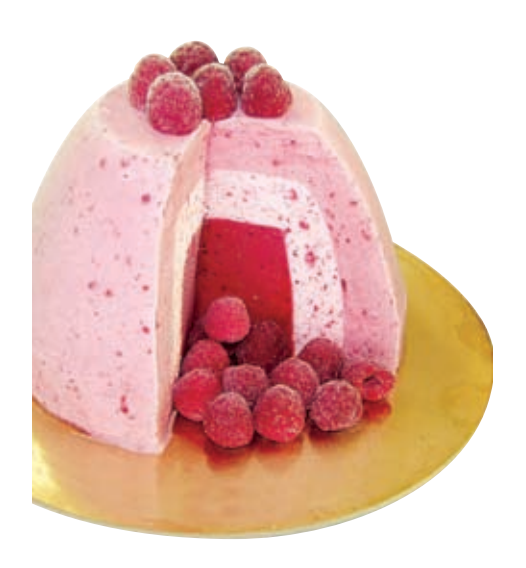
Sugar – Minimise your intake of beverages and foods with added sugar.